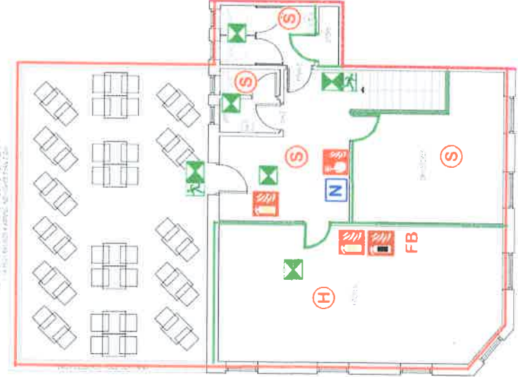
PROPOSED LAYOUT - FLOOR PLAN